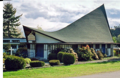
Gibsons United Church